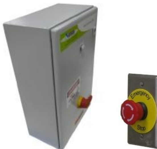
Figure 1 Nova 175A Main Disconnect Panel

Philips Healthcare MR: The proper distribution panel can be identified in the Philips site planning drawings → sheet EL → Electrical Legend → item CB Equal to item 175A 480VAC Circuit Breaker with shunt trip and related components