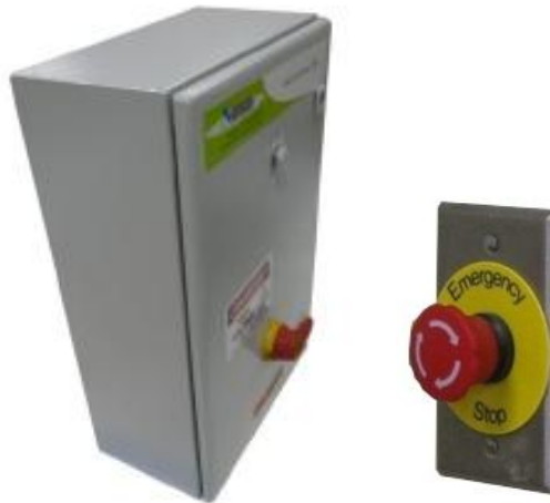
Figure 1 Nova 70A Main Disconnect Panel