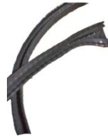
Figure 20: Grommet Material