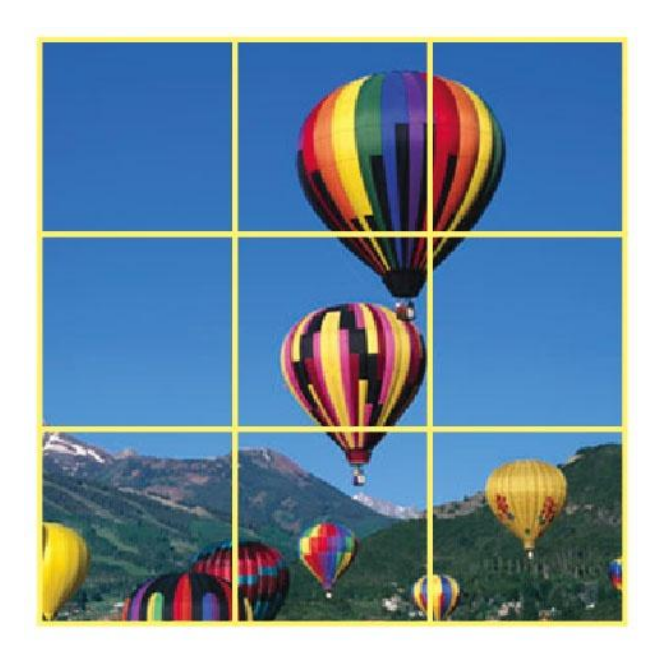
Figure 2 Sample 2x2 Mock Up

All images are designed and reviewed with the customers prior to printing to ensure accuracy and customer satisfaction.