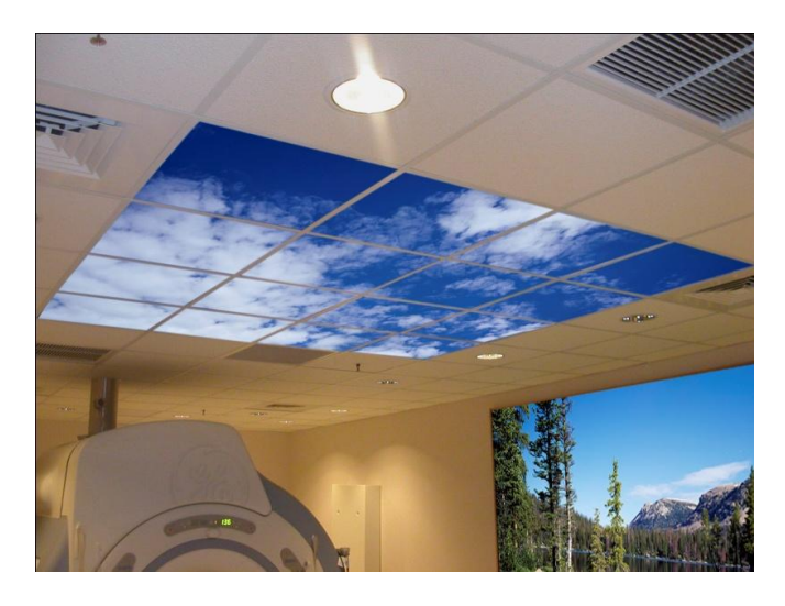
Figure 1 Nova Max Lumen LED 2x2 Graphic Mural

Patients of a scan room with visual therapy typically report a positive scan room experience with increased relaxation and reduced anxiety and stress as compared with patients in a non visual therapy environment.